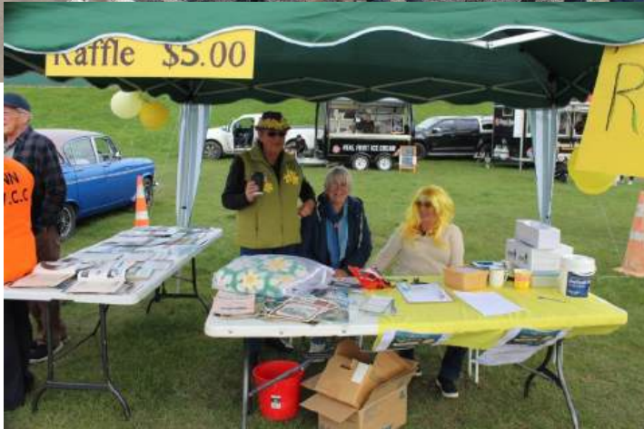
Some of the Daffy day Helpers awaiting the arrival of the Show N Shine entrants