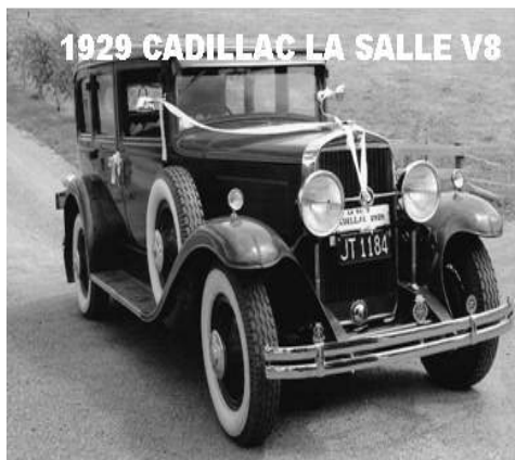
1929 CADILLAC LA SALLE V8

Just a few shots of the many participants , waving their flag for Nelson Cancer Society