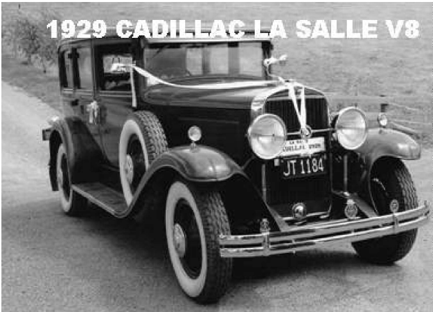
1929 CADILLAC LA SALLE V8