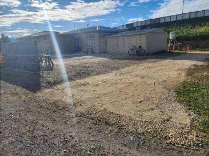
Hardfill all spread / levelled and compacted