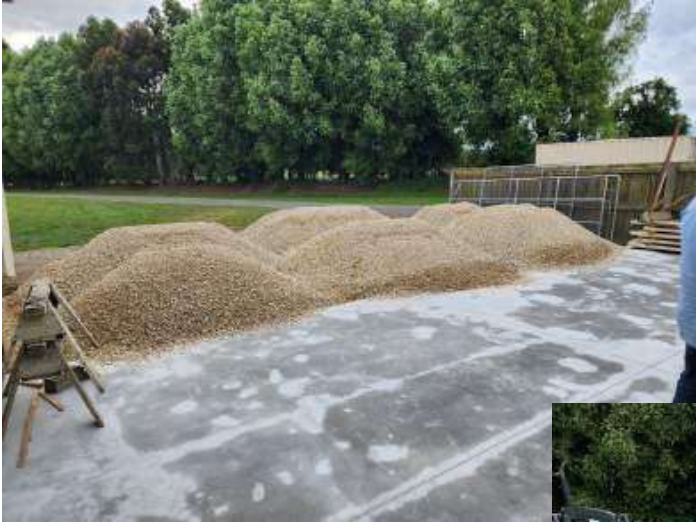
Slab down and hardfill delivered