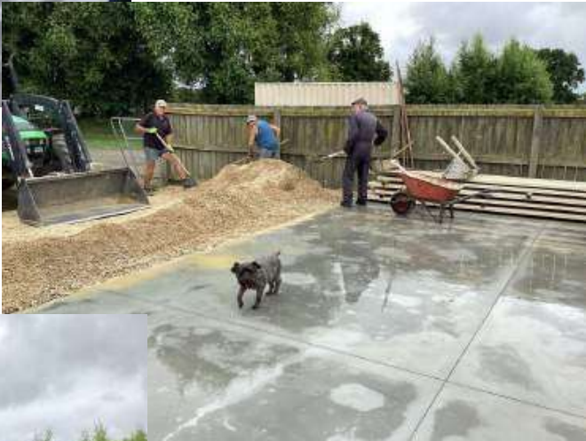
Hardfill being spread