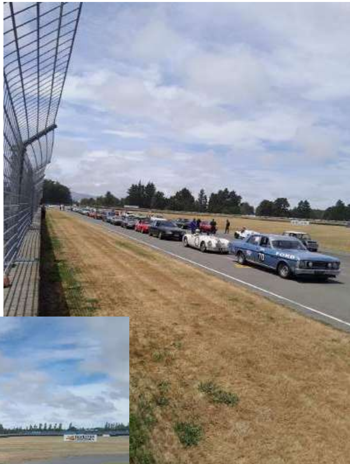
The Grid line up