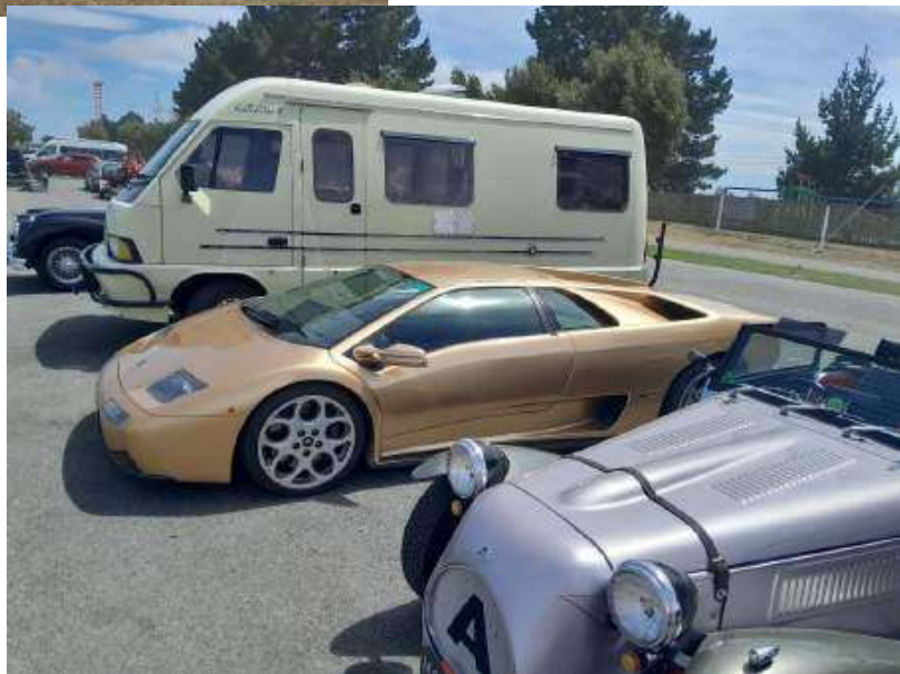
Rob Thompson parked next to the Lambo hoping some of the gold would rub off on the van