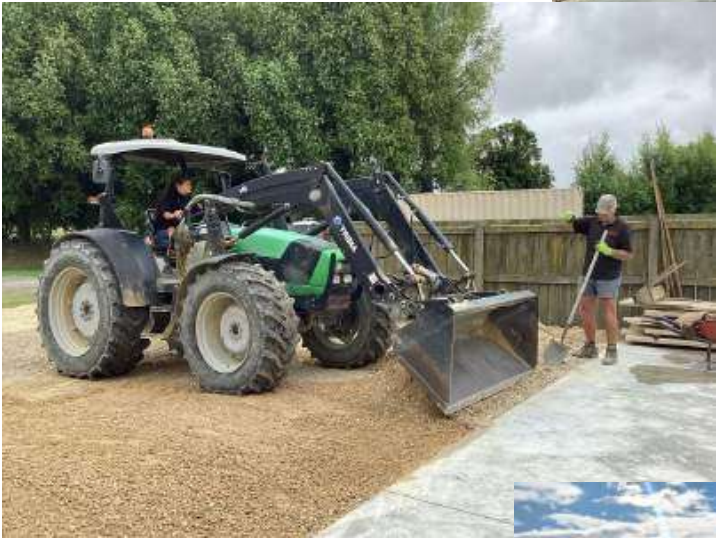
Speedway loader helping to shoulder the load