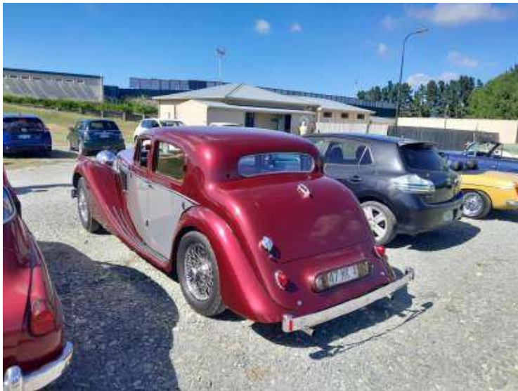
Discretely hidden under the boot lid is the extensive tool kit