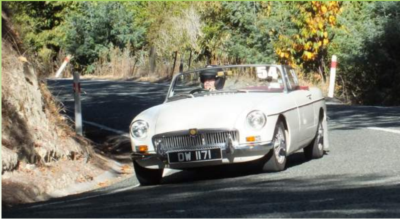
#54 Jeff Sewell, MGB Roadster; time 2 : 12 . 99