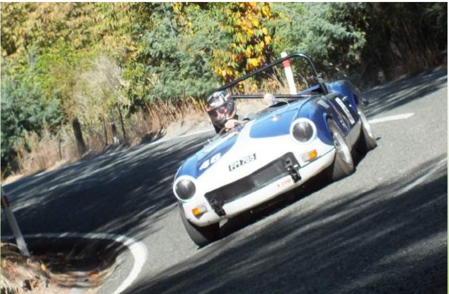
#46 Sanford Huckle, Triumph Spitfire; best time 1 : 54 . 82