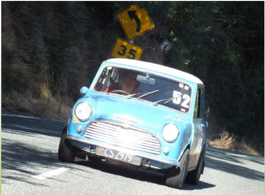
#52 Murray Schwass, BMC Mini; time 2 : 03 . 25