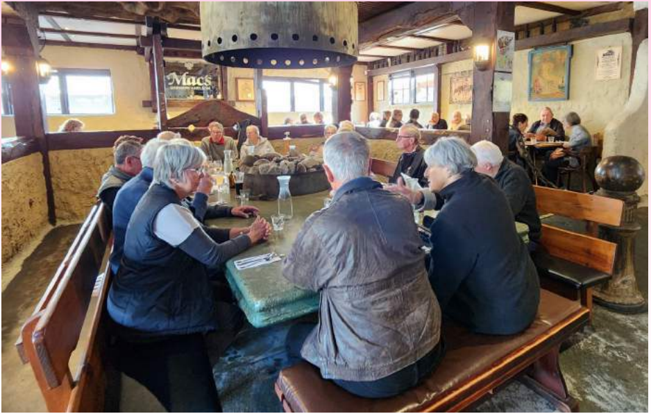
Above: 20 lowlanders took their place for lunch at Smugglers