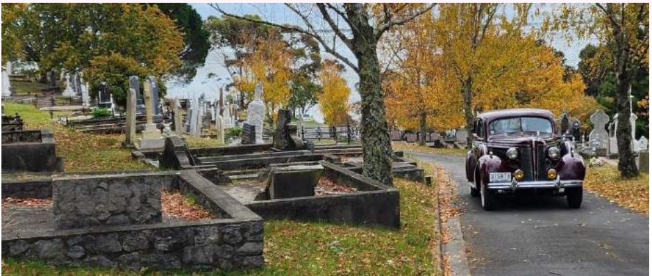
Darcy Boveys Buick 8 and alan Browns beautiful Alvis coming up to the top of Wakapuaka Cemetary