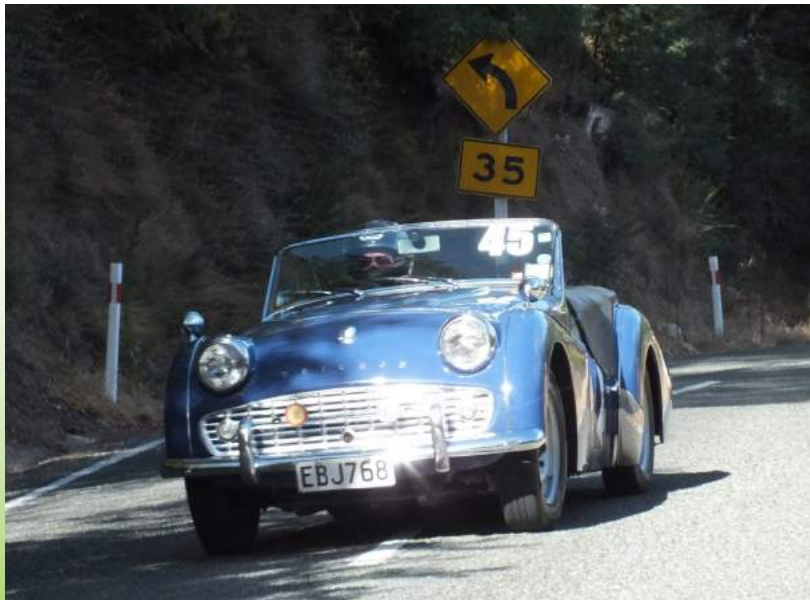
#45 David North, Triumph TR3; time 2 : 01 . 81