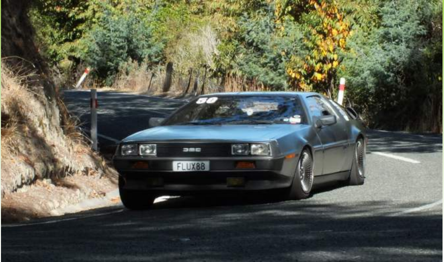
#50 Jarred Dacombe, DeLorean; best time 1 : 46 . 04