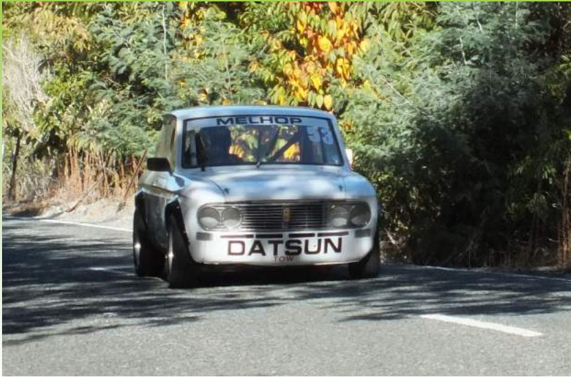
#53 Evan Henderson, Datsun Bluebird; time 1 : 56 . 83