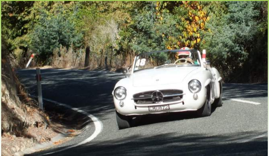
#48 Burkhard Strauch, Mercedes 190SL; best time 2 : 02 . 60