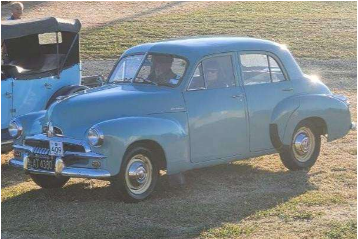
Gloria Pegg's - Family's 1955 Holden FJ Great to see it out on its first run for sometime at the 2024 SI Easter Rally