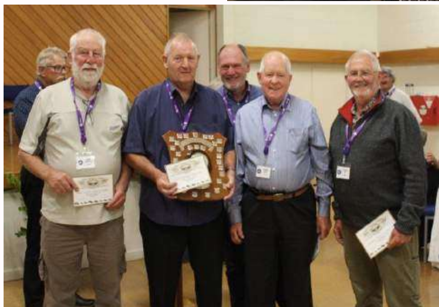
Penzoil Trophy win- ners of SI Teams