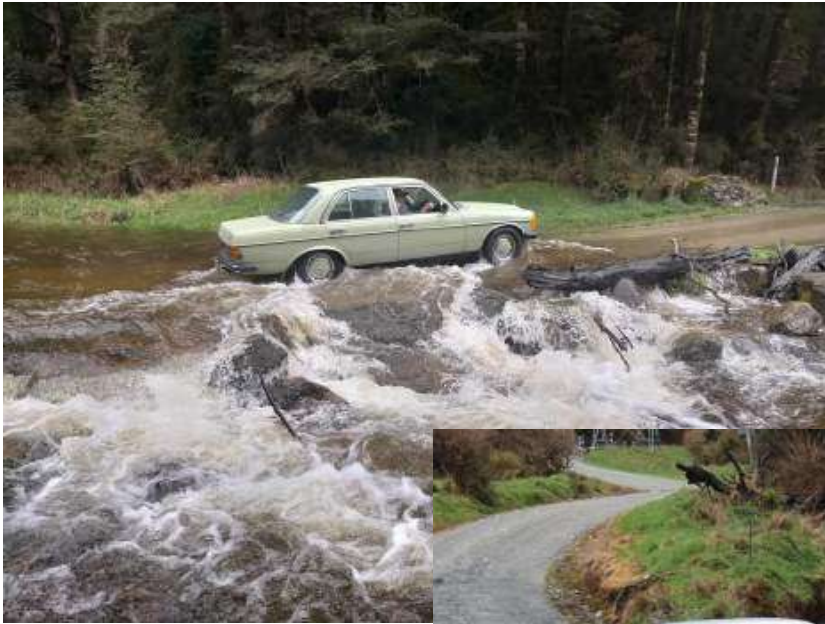
Rays Merc crossing the last water way