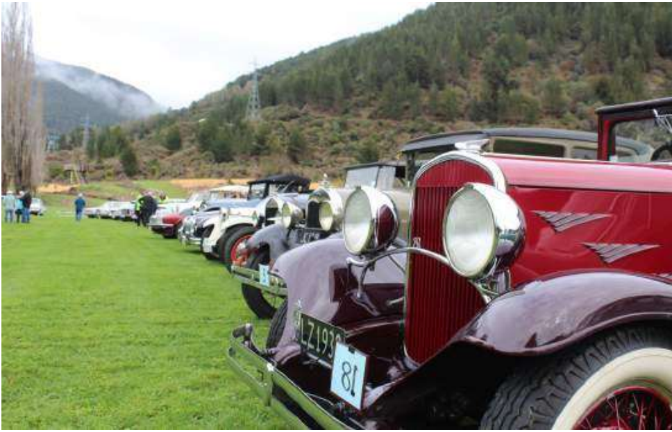
The Lyall's Front lawn