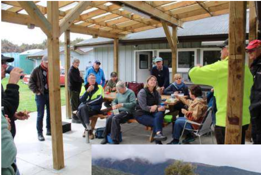
Mataki Lodge for lunch