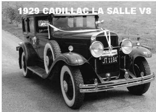
1929 CADILLAC LA SALLE V8

"LASSIE" - ENTRUSTED TO THE MOTUEKA DISTRICT MUSEUM