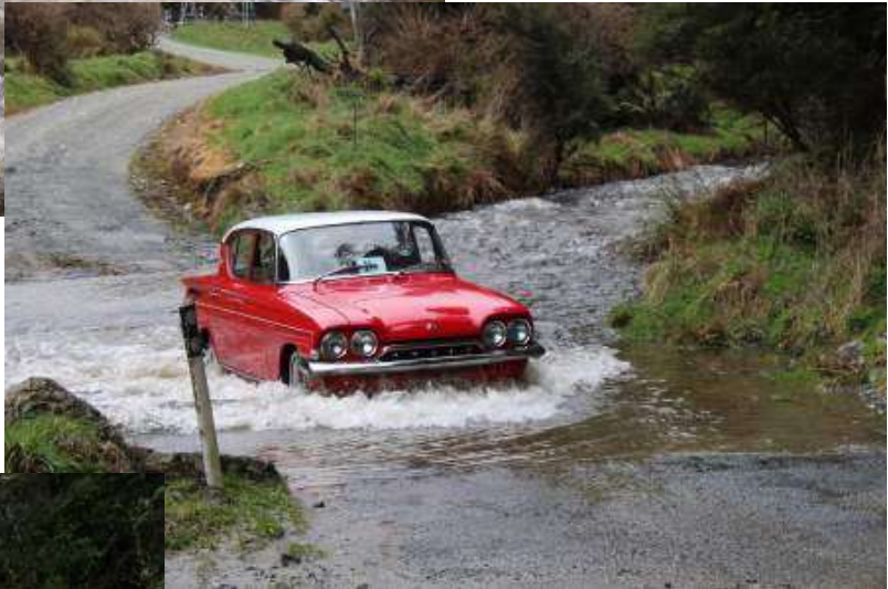
Pat Knowles almost through the first ford but alas water in the dizzy