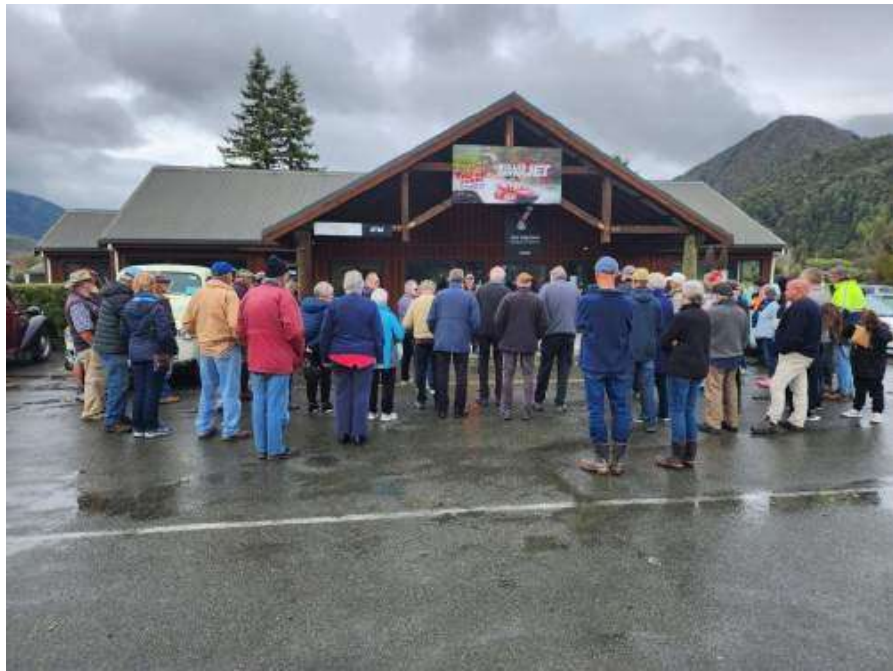
Rally briefing Sat- urday morning