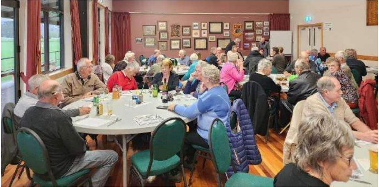
The Evening Meal and prize giving Recreation Centre Murchison