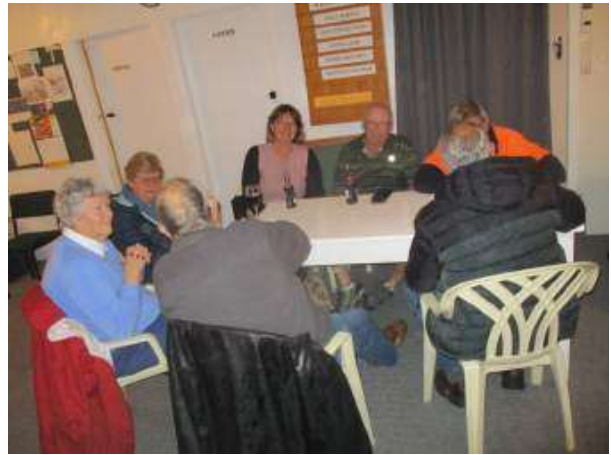
Nogin n Natter At the Murch Bowls Club Friday Night