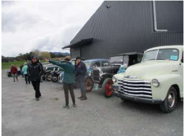
The Hop Farm on Mount Ella Station Tutaki Valley