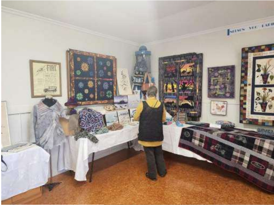
Left and below VCC Ladies Craft group's awesome display of their work at the Craft tour