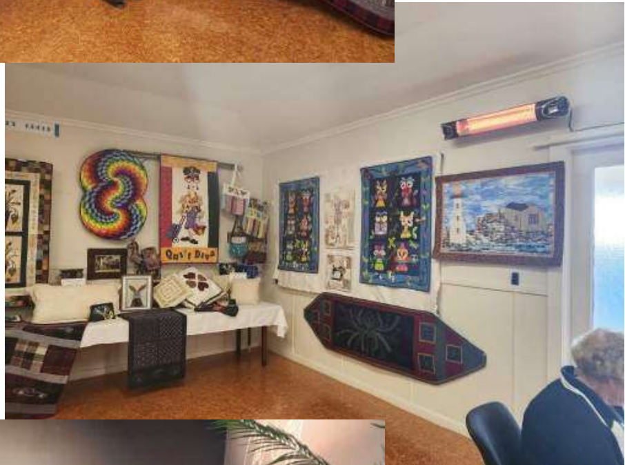
The collection certainly brightens up that end of the clubrooms