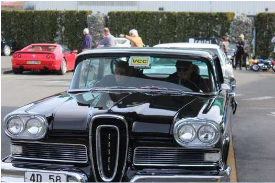
The NCCM Edsel became a welcome and very topical taxi Ferrying AGM Attendees to the airport