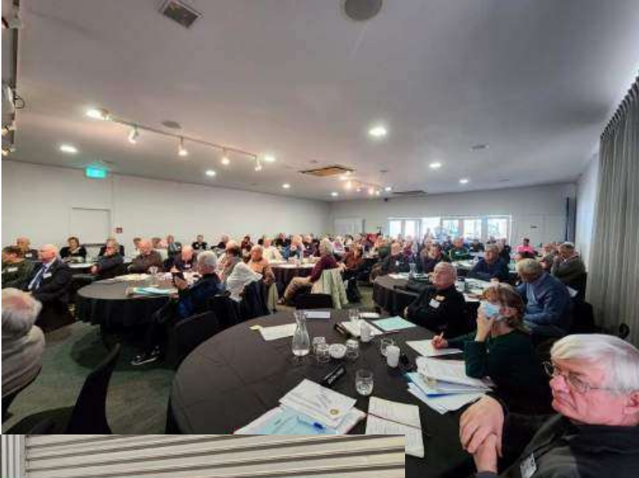
AGM Branch Delegates