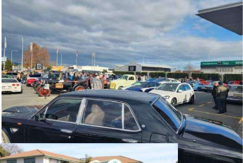
The mix of AGM and Coffee and Car morning meant a very busy NCCM car-park