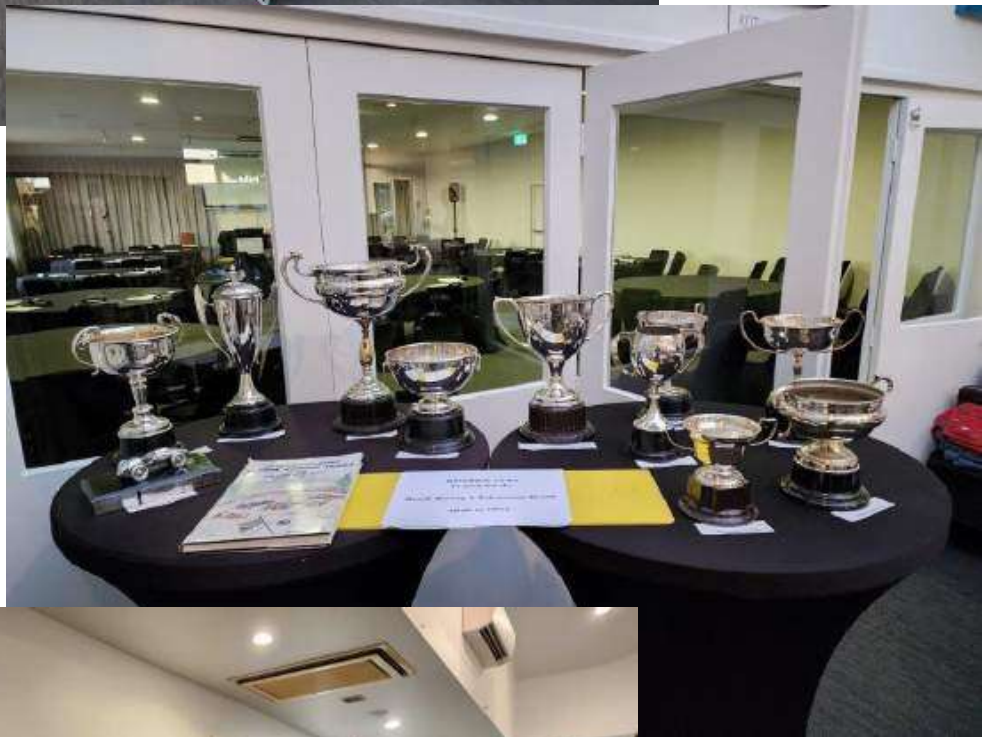
Beach Racing trophies