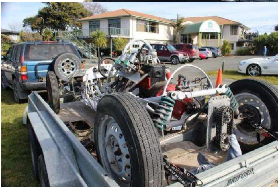
Kit Brydon's father Bruce raced this car at the Tahunanui Beach Races